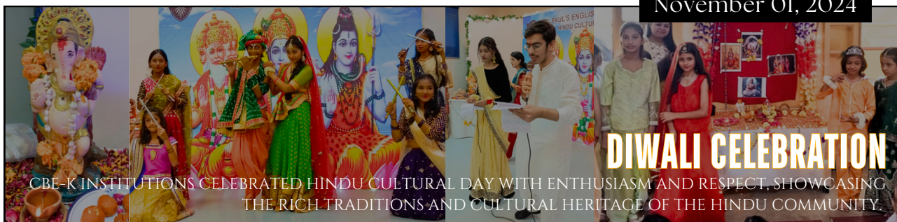
CBE-K INSTITUTIONS CELEBRATED HINDU CULTURAL DAY WITH ENTHUSIASM AND RESPECT, SHOWCASING THE RICH TRADITIONS AND CULTURAL HERITAGE OF THE HINDU COMMUNITY.